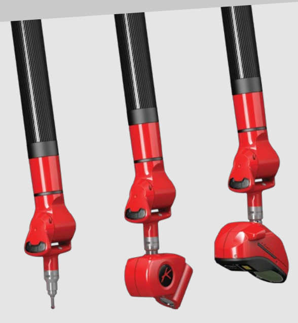
Ace 6 axes

Software used for probing and scanning: Metrolog, Polyworks, Geomagic, Powerinspect, Capps, etc.