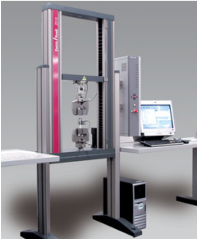
Table-top machines Z005 up to Z020 of the Allround-Line